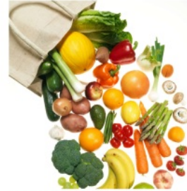
FRESH FRUITS & VEGETABLES